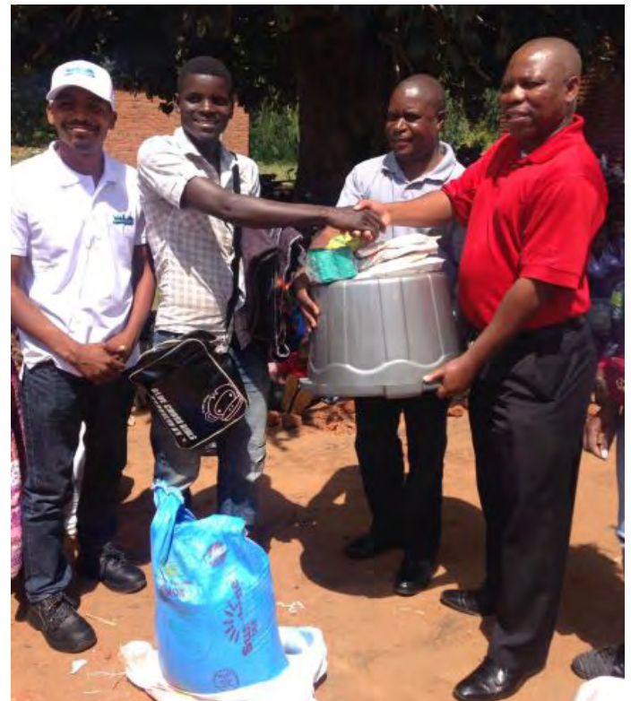
CONGOMA Officials distributing relief items

Before the distribution of other relief items, Medical supplies amounting to two Million Malawi kwacha were donated first at Zomba District Health Office. Receiving the Medical Supplies on behalf of members of staff at the hospital,