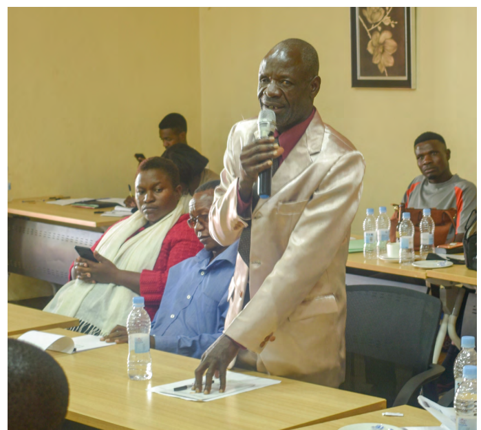
One of the Chiefs from Balaka Making a point.