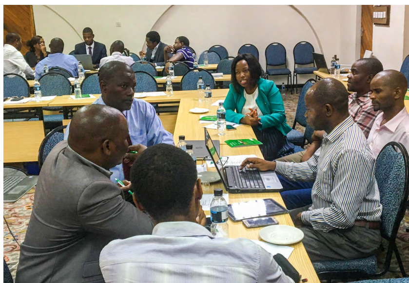
Group work during the conference