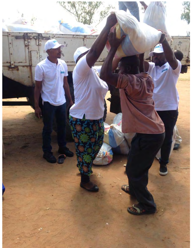
Officials from Goods for Good distributing relief items

The relief Support items donated were collected from the following Organisations; Goods for Good, Little Dresses for Africa, Love Support and Unite, Children and Pastors Care Ministry, Total Land Care Malawi, PACENET, Malawi Association of Counseling, Eva Demaya Centre,