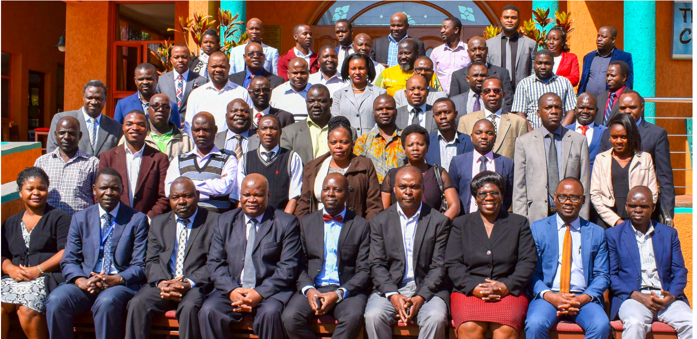
Group photo of participants

establish accountability mechanisms for each SWG and establishing a basket fund for SWGs to ensure that no such group is left behind due to finances. Further resolutions were made to ensure that the Sector Working Groups are