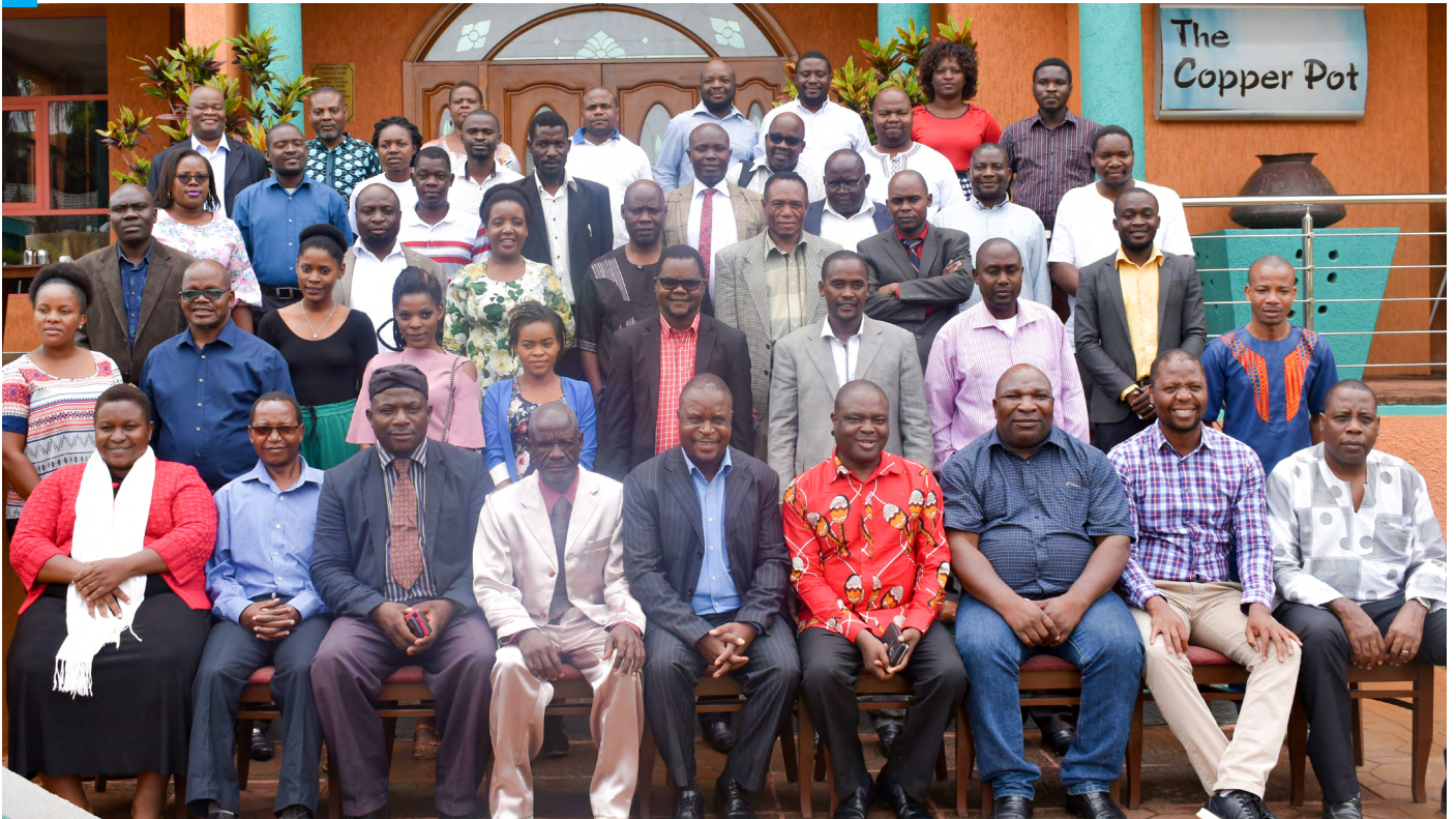
Group Photo of Stakeholders during the National Interface

fail to hold duty bearers accountable because they are not empowered with necessary information.