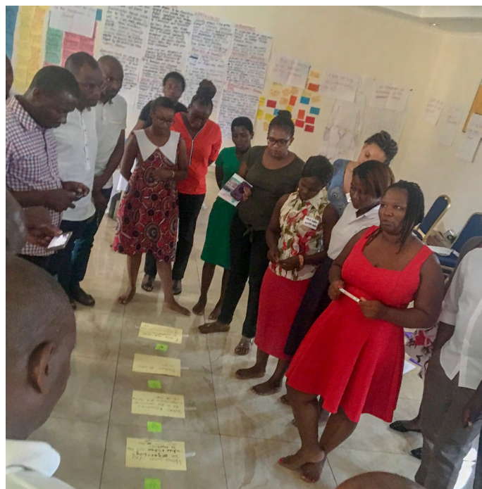
Participants showing issues transpiring in the society

The other partners of IM Swedish Development partner and members of CONGOMA that participated in the workshop were Civil Society Education Coalition (CSEC), Women's Legal Resource Centre (WOLREC), Centre for Environmental Policy and Advocacy (CEPA), Malawi Economic Justice Network (MEJN) and Centre for Youth Empowerment and Civic Education (CYECE).