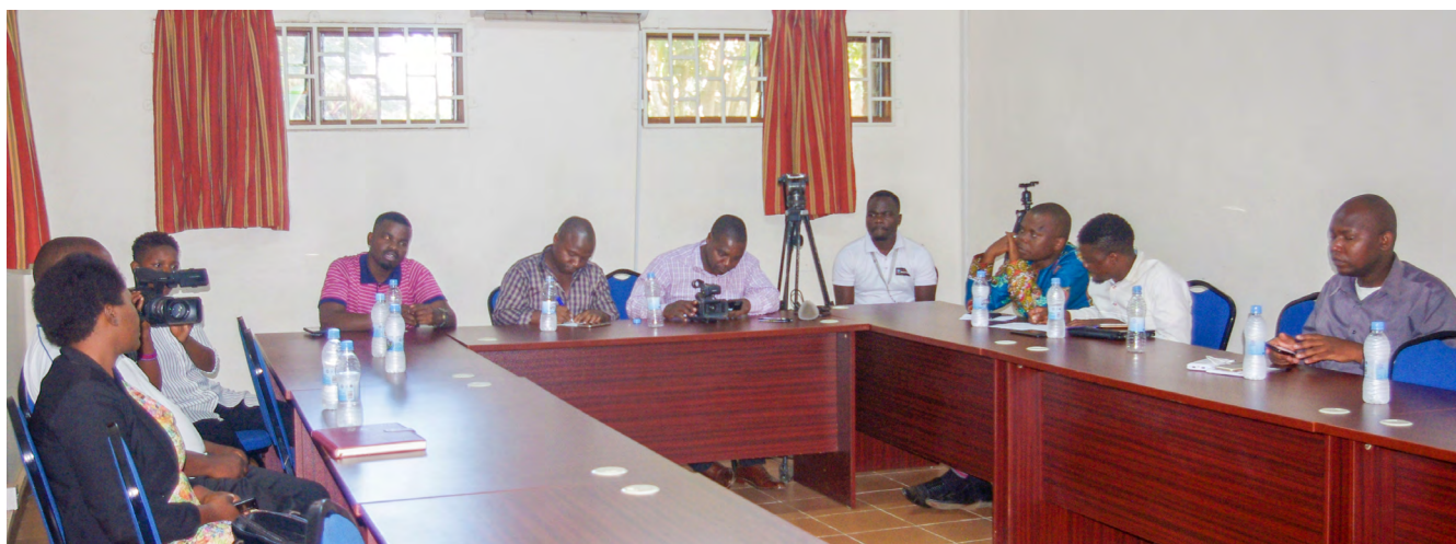
Media Practitioner during the press briefing