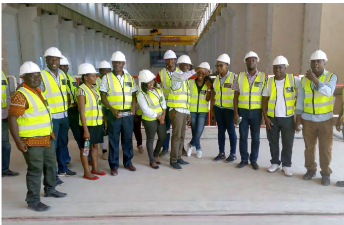
Part of the Malawi Team

The whole process was made possible with financial support from IM Swedish Development Partner.